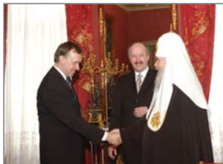
Presentation and signing of the paintings of His Holiness Alexy II, Patriarch of Moscow and All Russia in Russian Federation Embassy Gallery in Tallinn, Estonia on February 18, 2004. Handing over the paintings in Moscow on March 24, 2004.