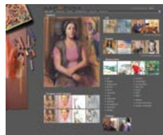
Gallery. Over 500 paintings