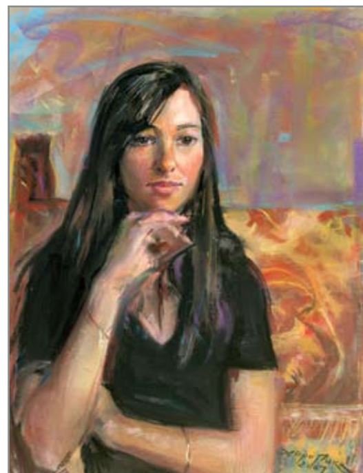
Kelly. Pastel 24 x 20", 2007.